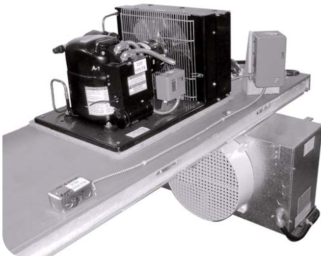
TOP MOUNT FACTORY SELF-CONTAINED SYSTEMS